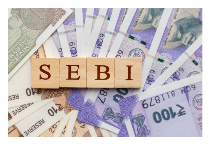
Amendments to the SEBI (FVCIs) Regulations, 2000 and operational guidelines for FVCIs

(one) scheme whose liquidation period has expired will be subject to appropriate regulatory action for continuing beyond the expiry of their original liquidation period.