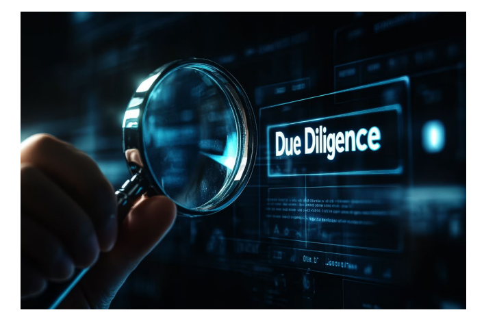
Specific due diligence of investors and investments of AIFs

SEBI, vide notification dated October 8, 2024, has outlined specific due diligence requirements for AIFs, their managers, and key personnel on investors and investments. These include: