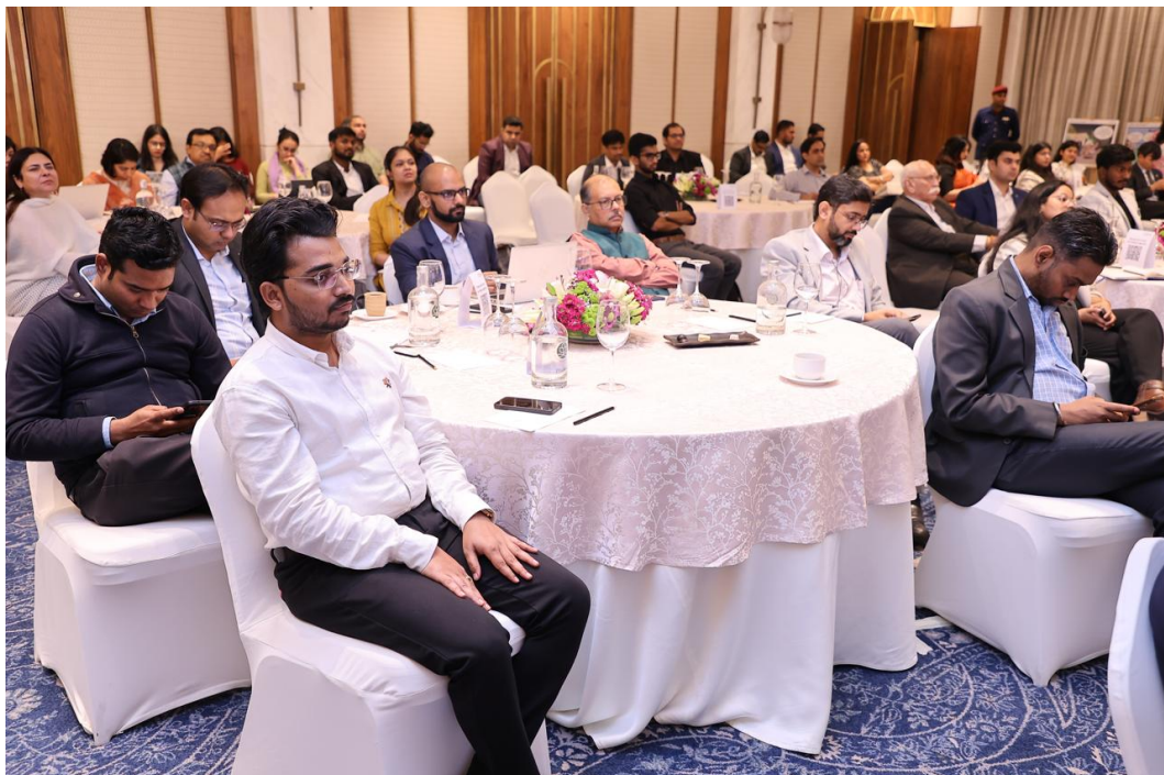
Audience participating in the Mentimeter Q&A session